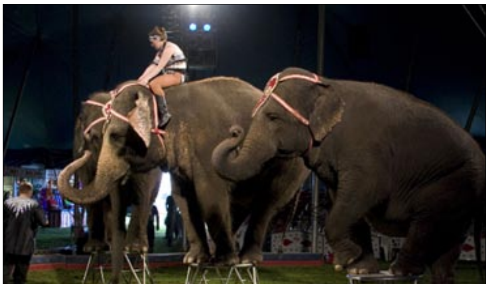
RIDING HIGH — The Carson & Barnes Circus brought its big tent to campus for two shows on March 28 and A&M-Commerce staff took the opportunity to ride the elephants. The elephants were a crowd pleaser during the 71st annual tour of the circus.