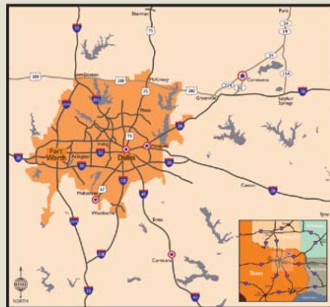
The main campus is located in Commerce, Tx about an hours drive east of Dallas

Our program is funded by the National Science Foundation, which is interested in promoting the continuing education of community college students in the fields of science, technology, engineering or math.